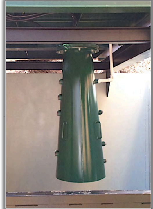
Key benefits and advantages to our proprietary draft tube include: Remote Monitoring, Sensing, Reporting, Metering, Management, Archiving and Security.