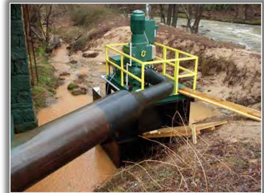
The turbine is complete and ready for the tour decking.