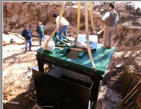
The platform design is offset and positioned on the splitter box.