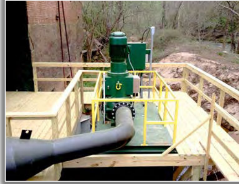
The decking and platform comply with OSHA and local regulations.