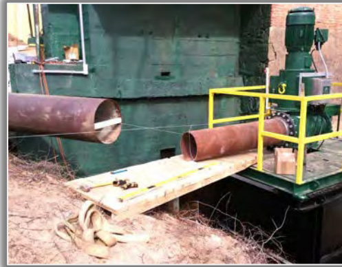
The penstock connections are typically performed last.