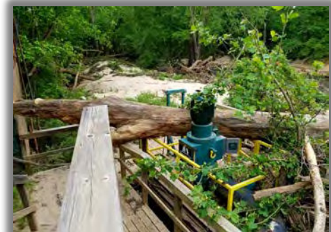
Once the water receded and logs removed, power was quickly back on.