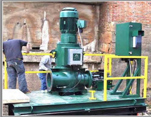
Once the platform has been placed, VFH assembly is 2 days.