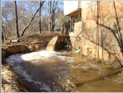
Site selection is critical. Flows were diverted from the creek.