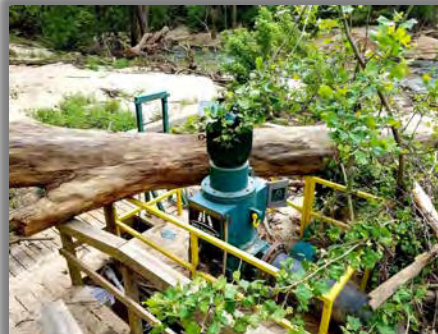
Chainsaws and boom trucks were busy clearing debris.