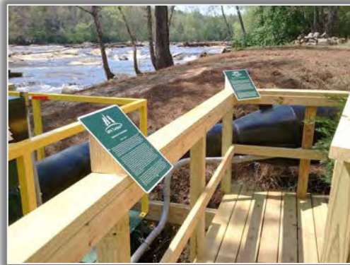
The deck is ready for self-guided tours, clients, regulators and students.