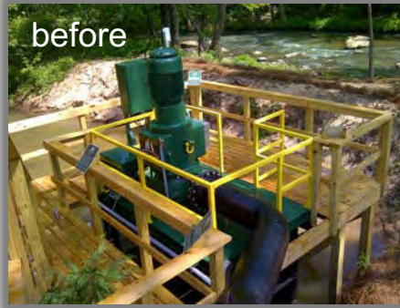
VFH Turbine™ and observation deck before flooding.