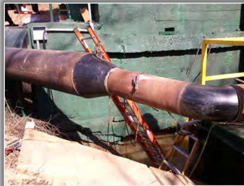
The screened flow from the creek is delivered by penstock .