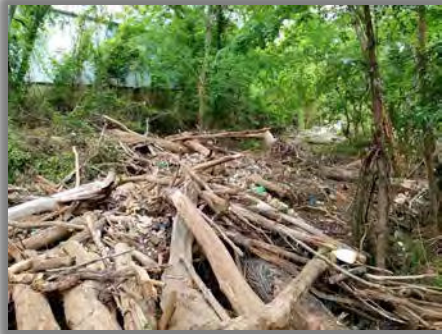
River rose over 30 ft. and left debris and logs everywhere.