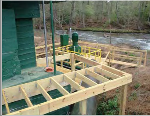
The observation deck was designed to accommodate tours.