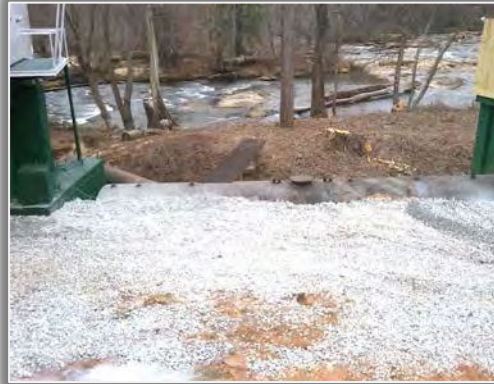
Infrastructure was upgraded to accommodate the project.