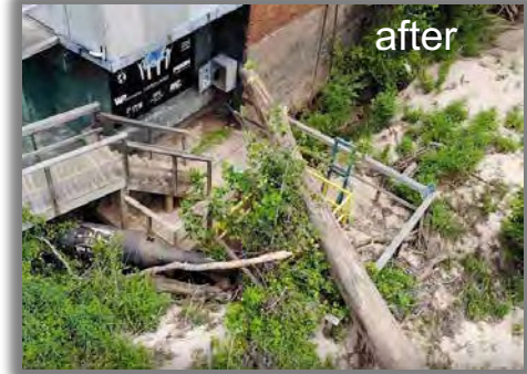
For 3 hours, the VFH was 18ft. under water but operational within 48 hrs.