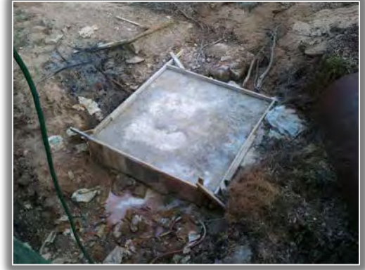
The 10' x 18' x 10" pad was required to support this entire system.