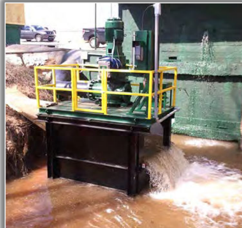
The system was officially operational and producing kW.