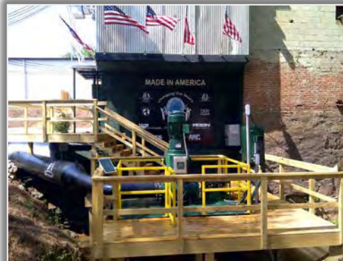
The entire process from design to generating power took <10 months .