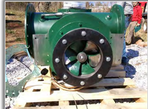
The turbine and runner was staged for placement on the platform.