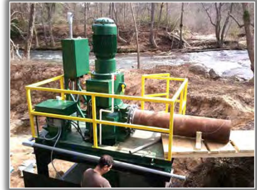
The pad, splitter box and platform support this entire system.