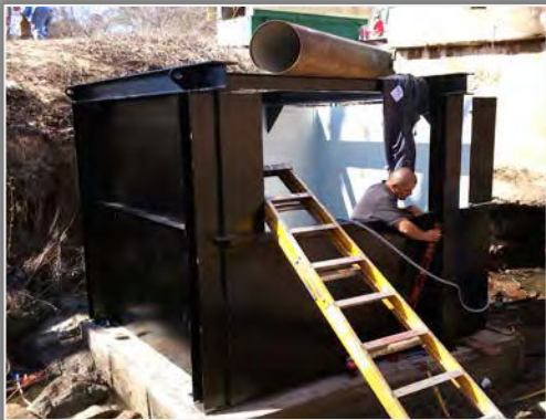
A splitter box is necessary for this site to handle the draft tube.