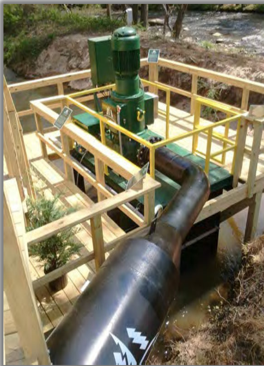
Snapping Shoals Creek (Georgia) 2011 - 2023

After 12 years of reliable power generation with virtually no maintenance or operating issues, this VFH unit was recently decommissioned, as we prepare its new home in Puerto Rico.